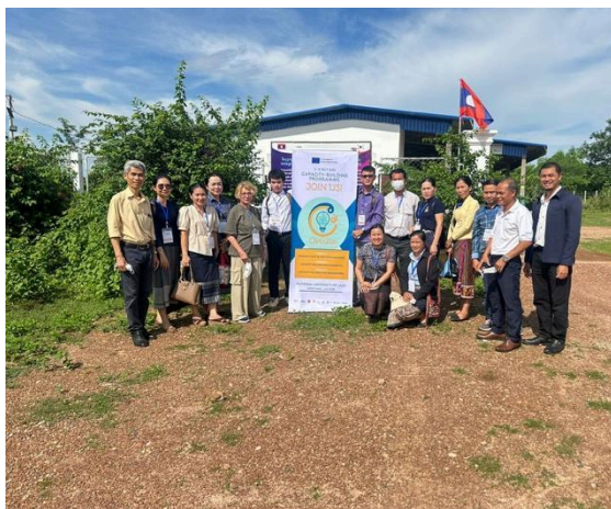
Visit a primary school that has waste recycling bank supported by GGGI