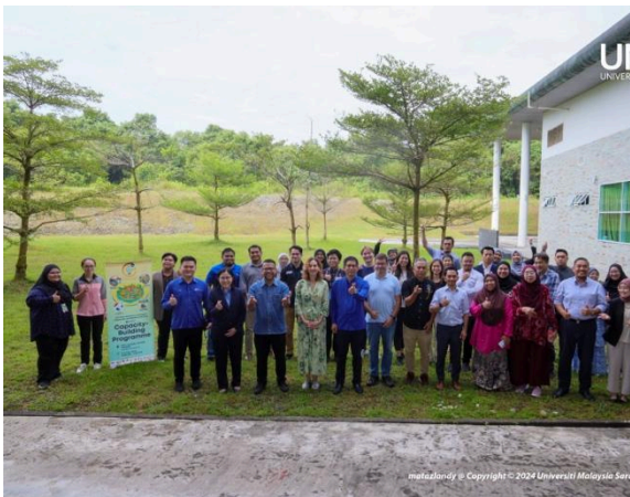
Field visit organized by UNIMAS, of Malaysia