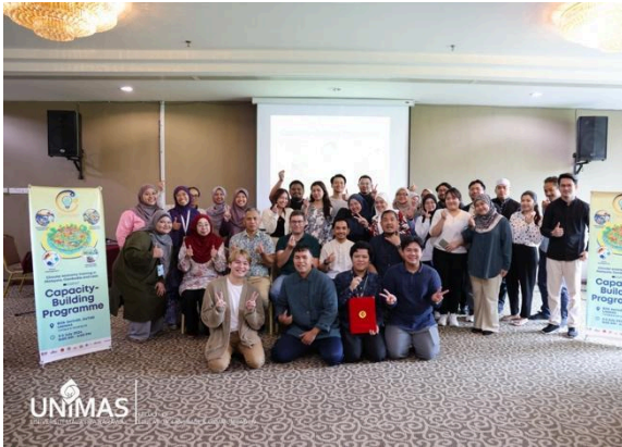
Opening session of the blended bootcamp and training activities at UNIMAS, of Malaysia