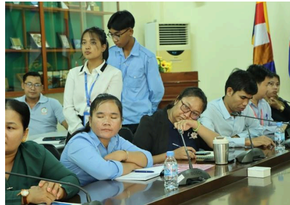
Opening session of the blended bootcamp and training activities at SRU, of Cambodia