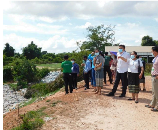
Opening session of the blended bootcamp and training activities at SKU, and site visit activities