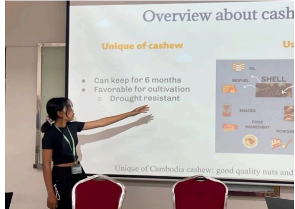
Student's presentation on future project and expectation of CIRCULAR project in the near future.