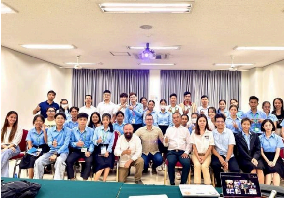
Opening session of the blended bootcamp and training activities at RUPP, of Cambodia