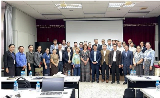
Opening session of the blended bootcamp and training activities at NUOL, of Lao PDR