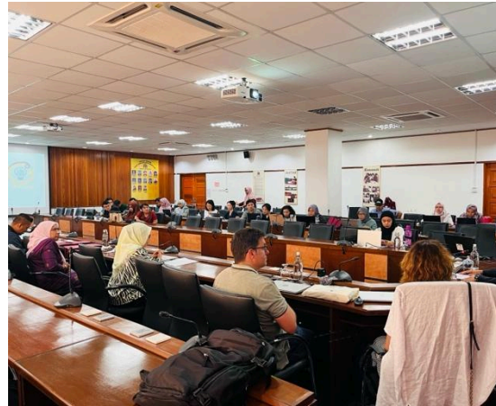
Opening session of the blended bootcamp and training activities at USM, of Malaysia