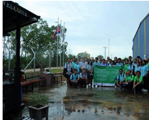
Field visit to Gomi Recycle Factory