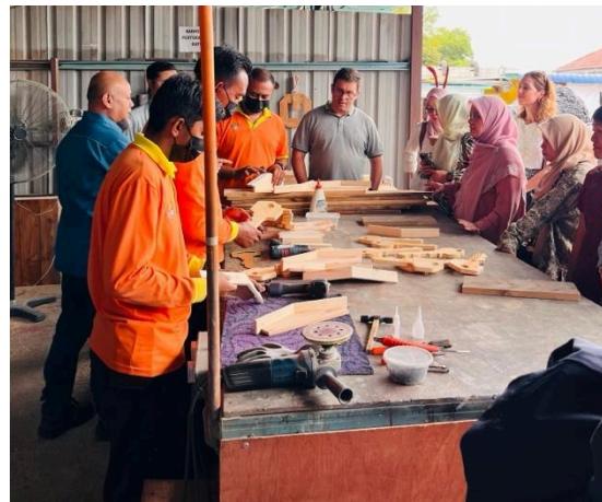
Site visit to MBSP upcycle, Beram Indah