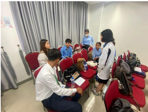
Training activities and interaction between trainee and trainer, site visits to RUPP Campus and Canteens